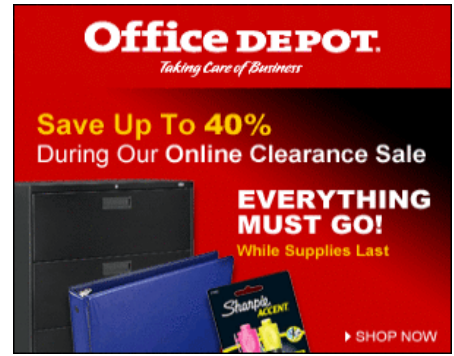
www.officedepot.com Ads by Google