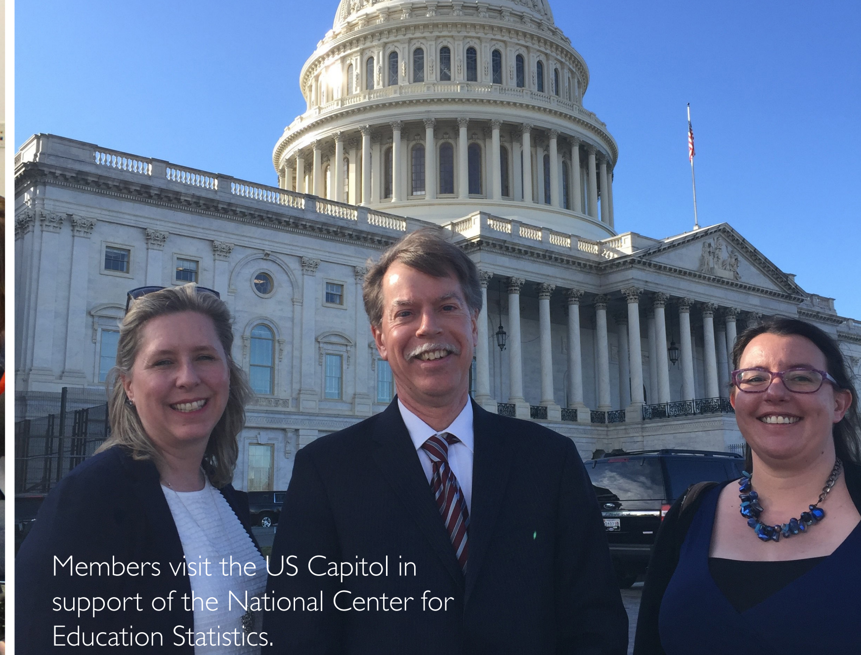
Members visit the US Capitol in support of the National Center for Education Statistics.