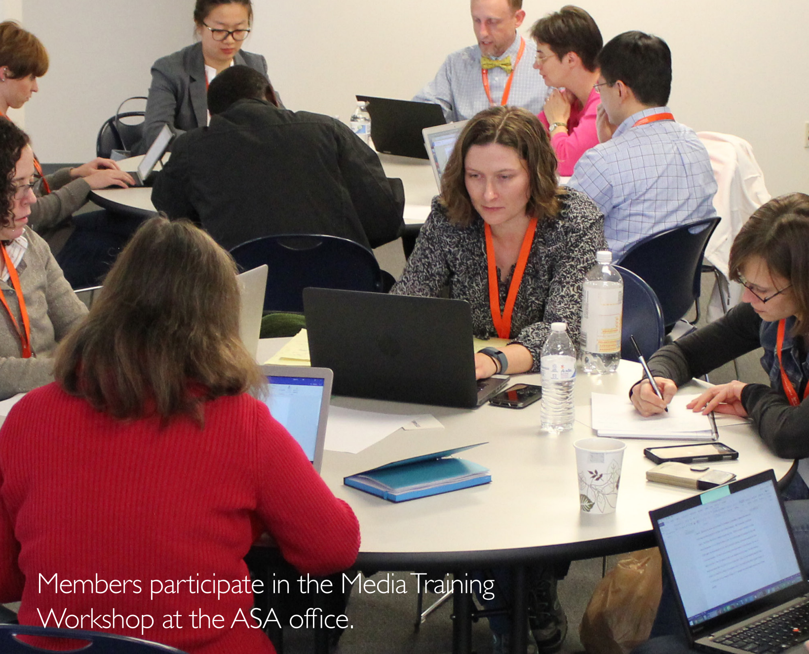
Members participate in the Media Training Workshop at the ASA office.